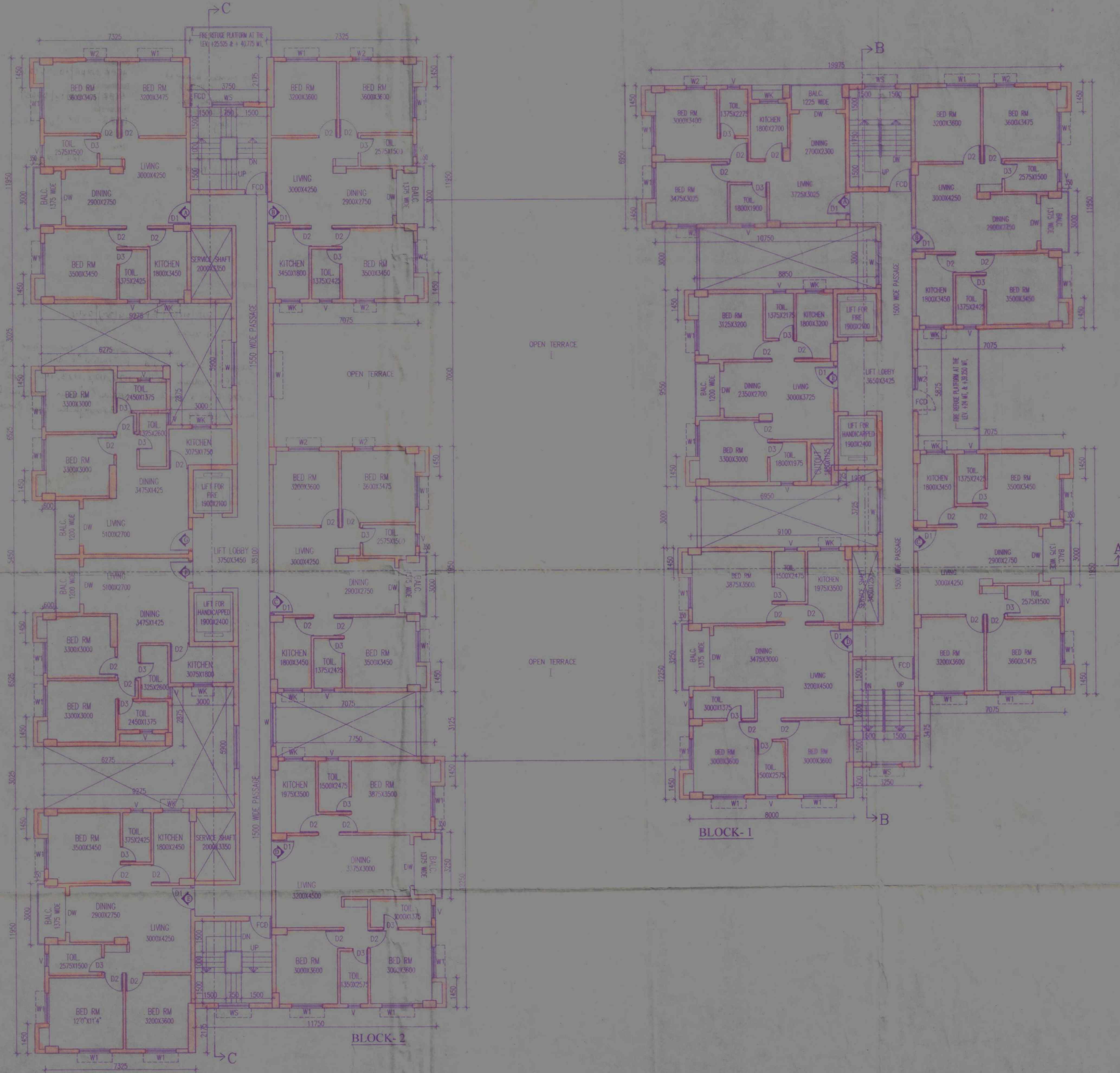
7TH & 12TH FLOOR PLAN BLOCK-1&2 SCALE * 1:100